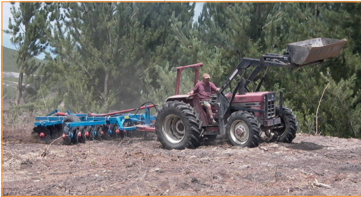
Picture (above) - 28 plate RM80 working up a harvested pine plantation in North Island, New Zealand.