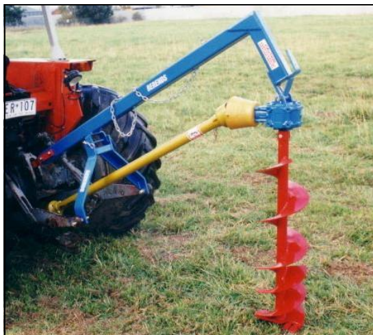
Standard Model with 12" Auger