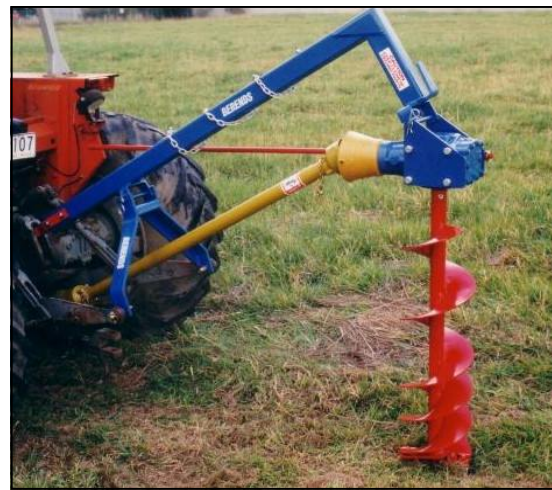
Heavy Duty Model with 12" Auger